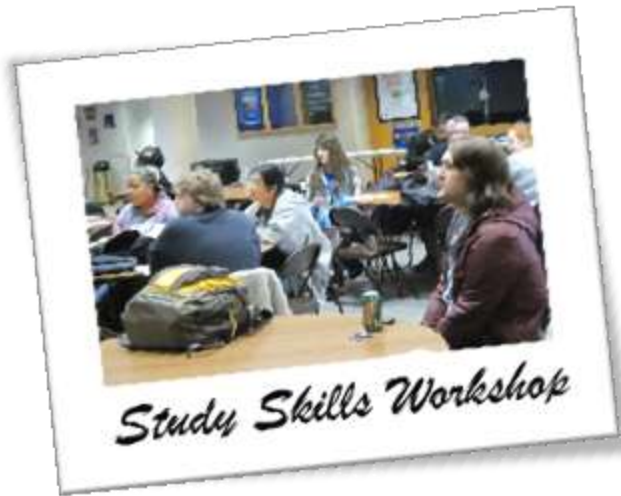
Study Skills Workshop