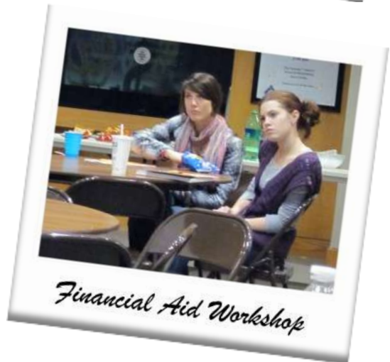
Financial Aid Workshop